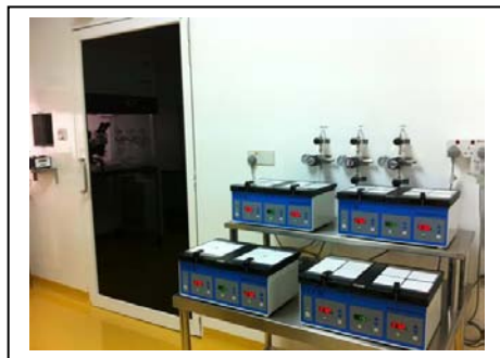
Multiple mini - incubators

Sunfert IVF is expanding to accommodate the growing numbers of infertile couples coming to seek professional assistance in human reproduction. The laboratory's capacity also must be increased in order to create the most conducive environment for the human gametes (eggs and sperm) and human embryos. Therefore, we would like to bring to your attention that Sunfert IVF's laboratory had increased the number of incubators so that each patient has its own privacy for embryo cultivation. A non-sharing concept of incubator can be advantageous to a certain extent, so that there are no extra loss of temperature and gas in the incubator. With the increased number of incubators, each patient has the privilege of having a private chamber for their embryos.