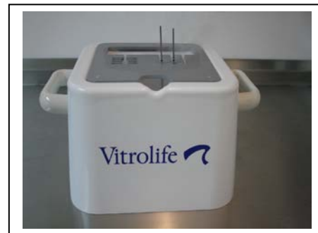
Vitrification Kit (latest technology in freezing)